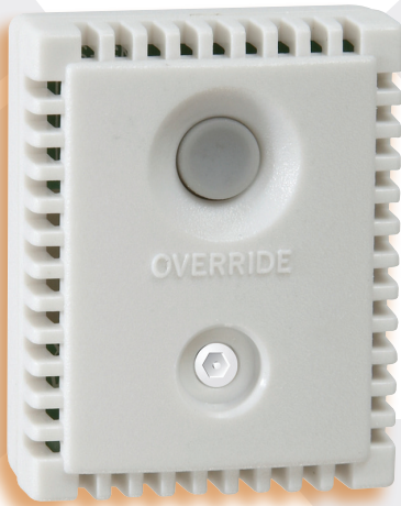
1.4" w x 1.8" h x .63" d