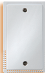
2.7" w x 4.5" h x .45" d

The sensor may sense room temperature where it is installed. The thermostat will control to the remote temperature sensor reading and show a blinking degree icon next to the temperature display on the thermostat.